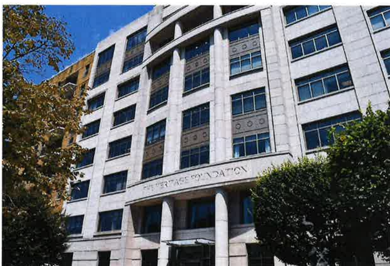
The Heritage Foundation's headquarters in Washington, D.C.

The Heritage Foundation gained traction when it published Mandate for Leadership: Policy Management in a Conservative Administration in 1980. Nearly two-thirds of its 2,000 recommendations were adopted by President Reagan, including tax breaks for the wealthy, increased military spending and union-busting tactics.